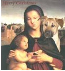
"Dawgs are always there -always faithful"