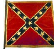
Flags of the 16th Georgia at The Georgia State Capitol and shown in this book