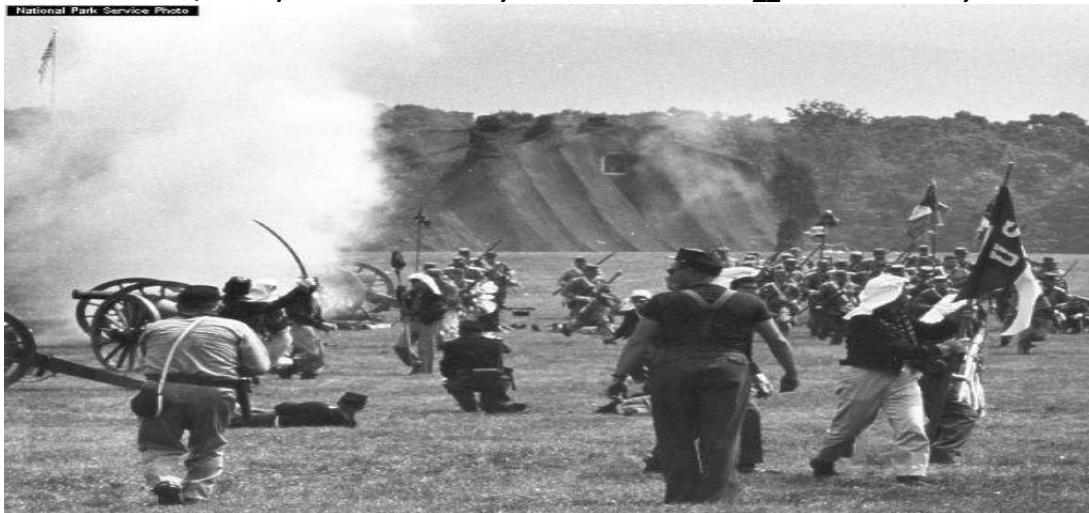
The Manassas re-enactment of 1961