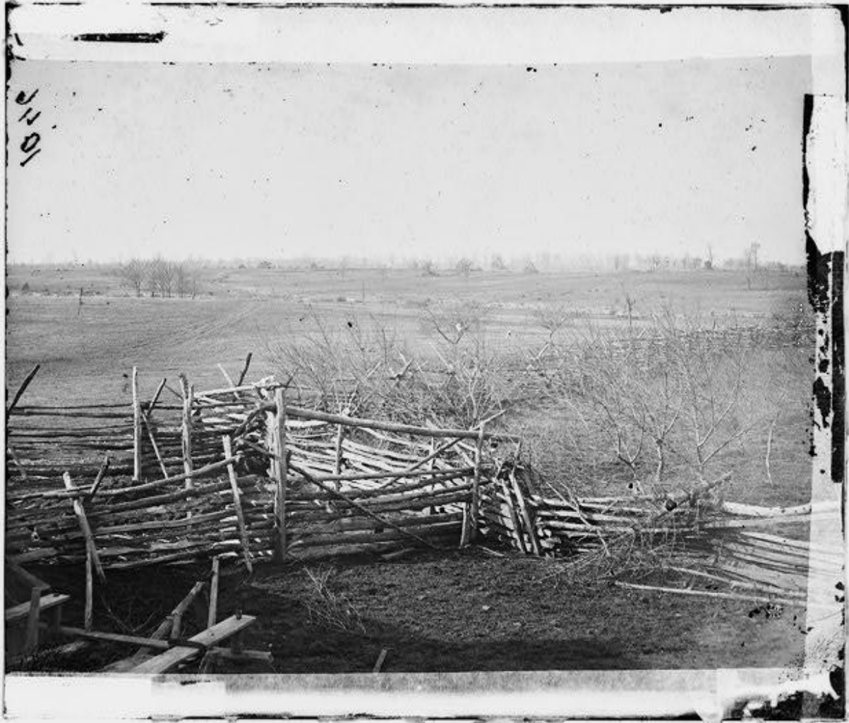
MANASSAS: IN HONORED MEMORY OF THOSE WHO FELL